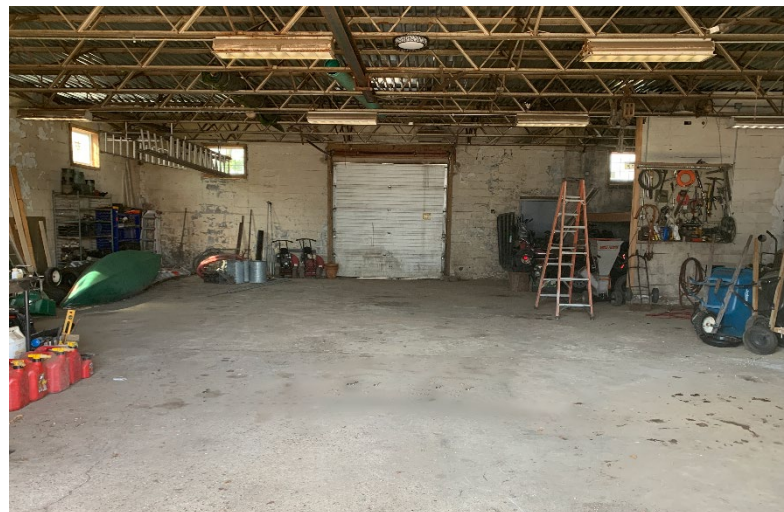
INTERIOR VIEW - REAR GARAGE DOOR