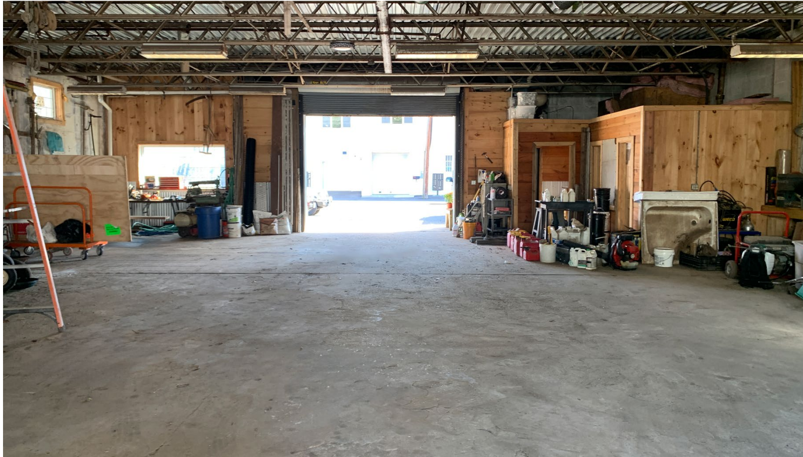
INTERIOR VIEW - FRONT GARAGE DOOR