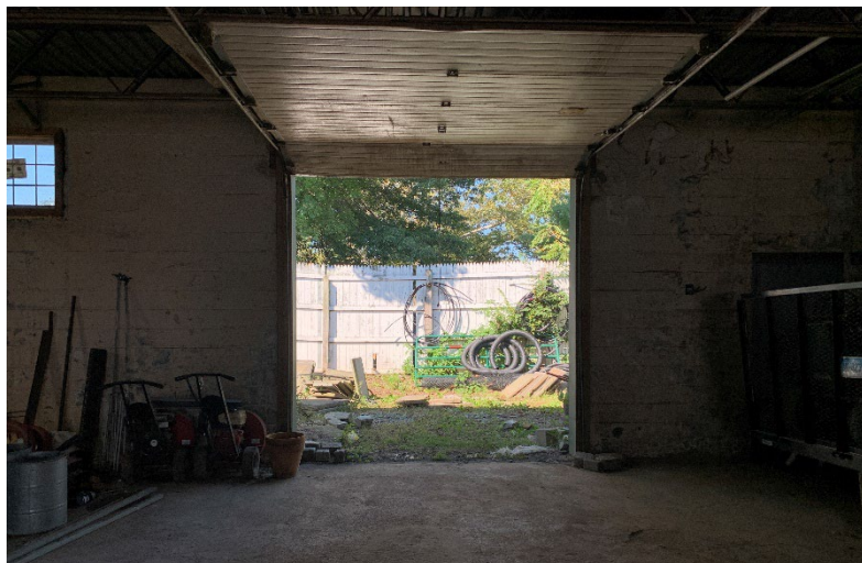
REAR GARAGE DOOR/YARD